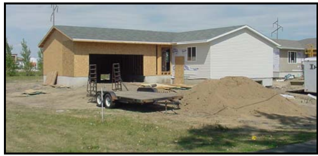
The house in Alexandria (windows will be added soon).

June 10, 2005 – Excavation began on the first Governor's House in Plankinton. Prairieland Housing Development (PHD) now has two houses going up in the communities of Alexandria, Emery, Plankinton, and White Lake. The first house of the project should be done in September.