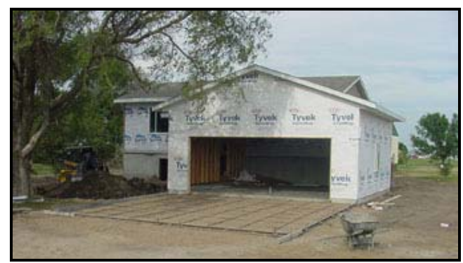
Preparing for siding on the Plankinton Vine Street site.

The HOME program requires that the buyer meet income guidelines for the county where each home is located. The following income limits apply to the houses for 2005: