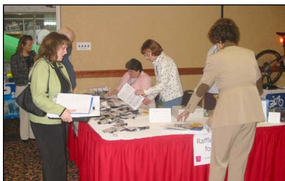
(Above: Conference attendees checking in.)

The Missouri River Corridor group hosted a regional tourism conference at the Kelly Inn in Yankton on March 23, 2006. Approximately 100 people attended, including state officials from both Nebraska and South Dakota, Convention & Visitor Bureau personnel, development corporations, Chambers of Commerce, local officials, local attractions, agritourism and small business owners, planning district personnel, and lodging providers.