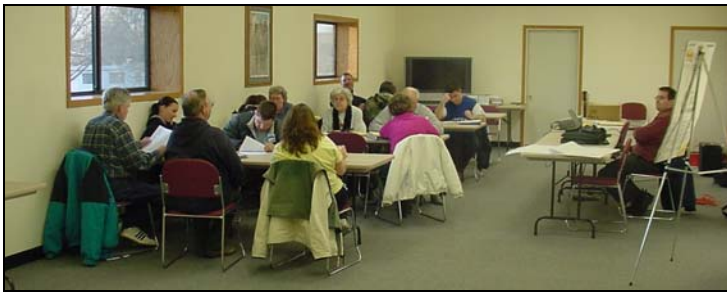
Photo: LeadershipPlenty session in Gregory