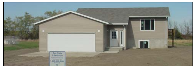
PHD house that was recently sold in Plankinton