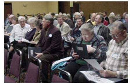
Legislative Forum (all three photos)