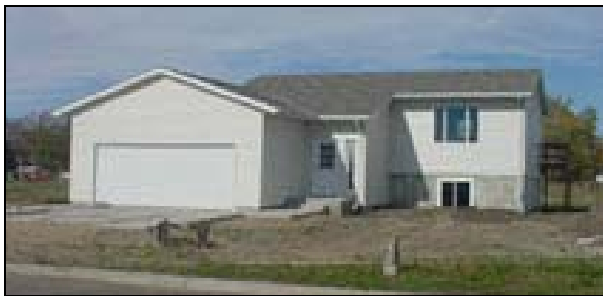
PHD House in White Lake

Prairieland Housing Development (PHD) is in the process of closing on its fourth sale of a Governor's House developed using one of the "split foyer" designs in White Lake. The house is located in a growing subdivision on the east side of town. The neighborhood is close to the school and the home features three finished bedrooms, entry foyer, and double garage. The lower level is also framed so that the rooms are already defined and will be easier to finish.